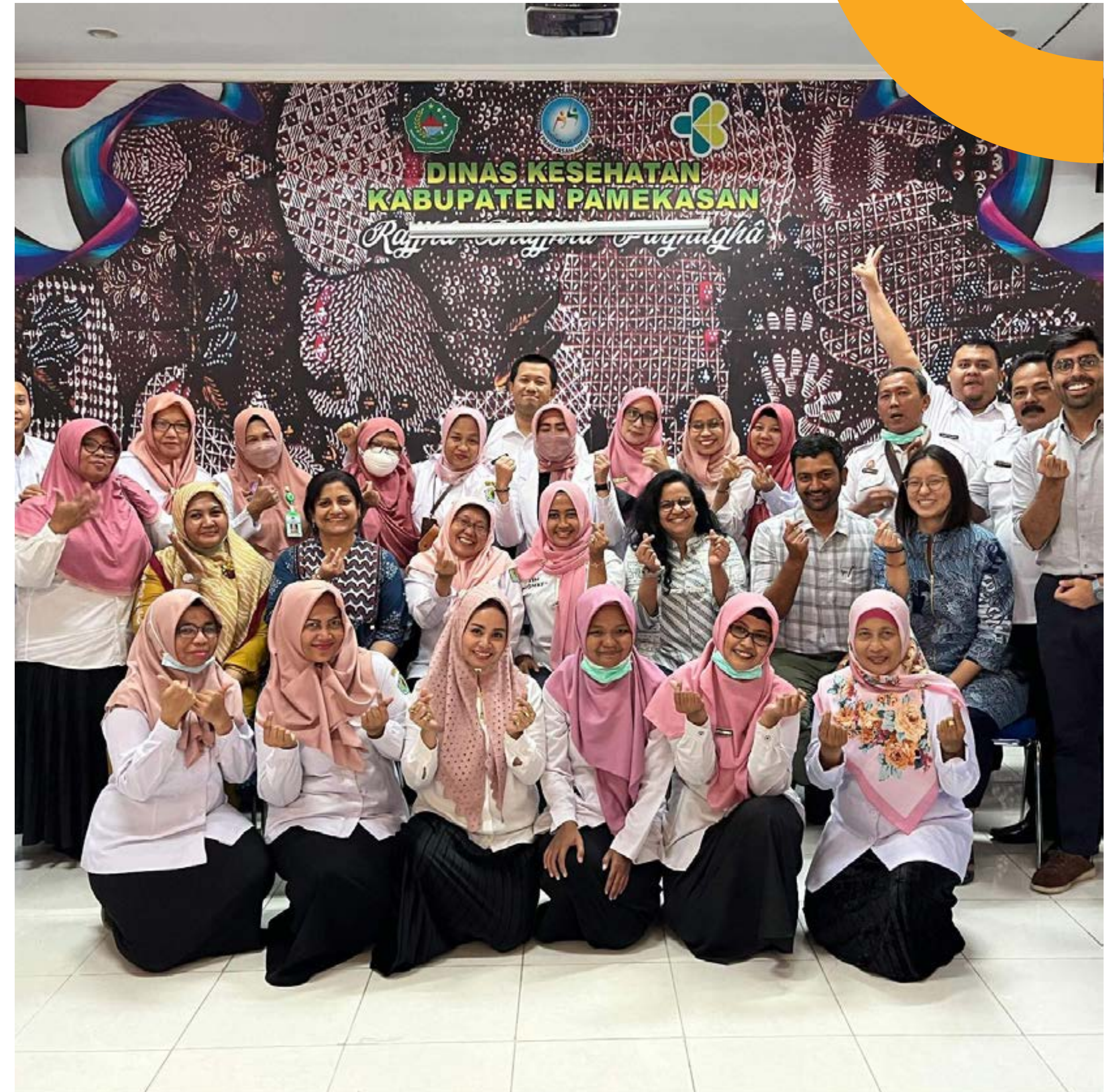
Our team and participants gather following a successful co-creation session in the district of Pamekasan, East Java, Indonesia.

Our teams gained deep learnings into the needs, pain points, gaps, and opportunities that will shape the CCP model in both Andhra Pradesh and East Java through 2023. We see co-creation as essential to the success and sustainability of our impact, and we are committed to making it a crucial first step when growing in new geographies and with new stakeholders.