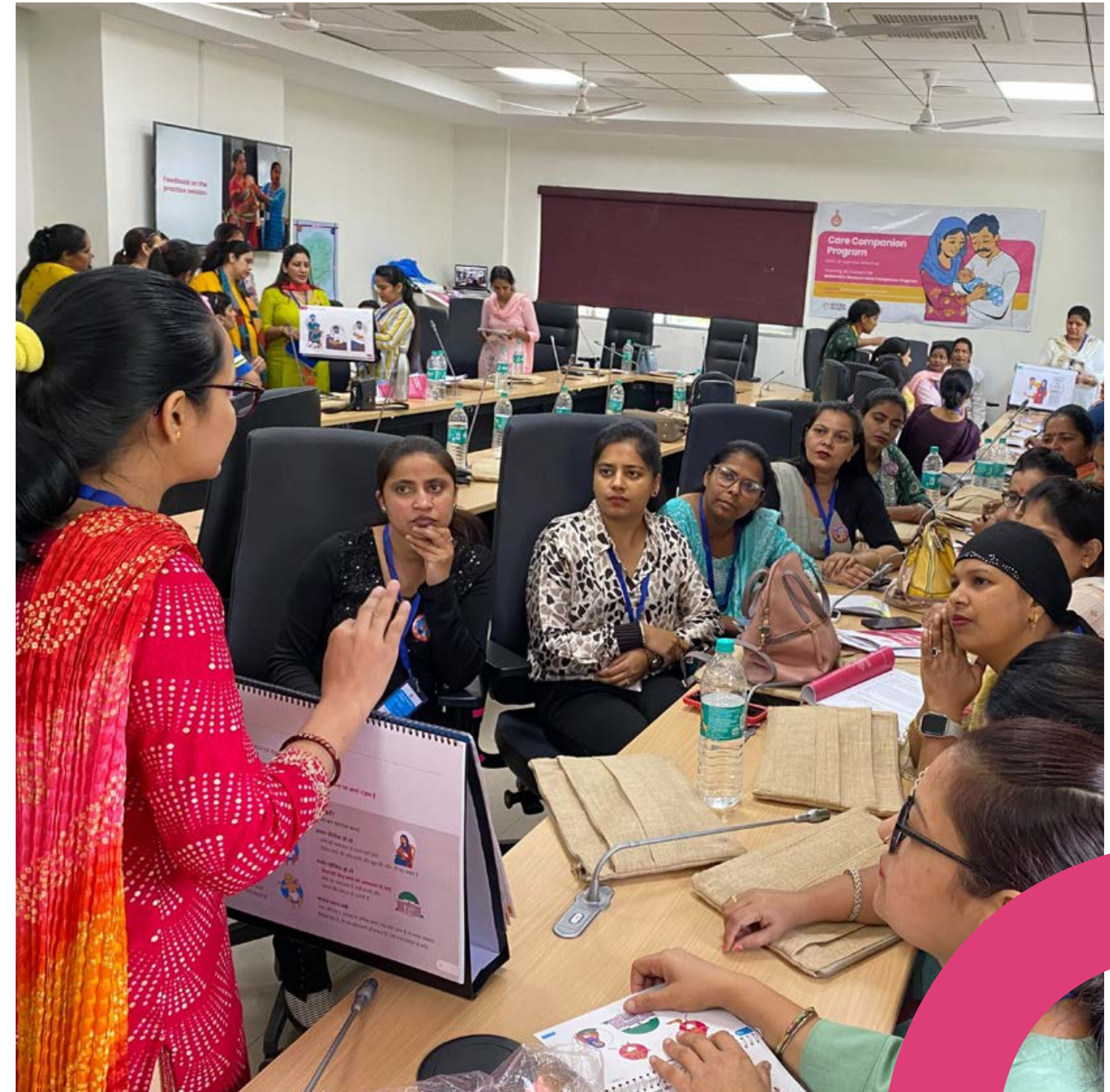
Participants engage during the first Care Companion Program Training of Trainers session in Haryana, India.

Additionally, we launched our programs in Dhaka Medical College Hospital in Bangladesh at a similarly fast, quality-first pace. Like AIIMS, Dhaka Medical College is one of the largest tertiary care centers in Bangladesh that both serves its capital city and welcomes patients from around the country. As our programs gain trust and traction in Bangladesh, we anticipate having a national footprint by the end of 2023.